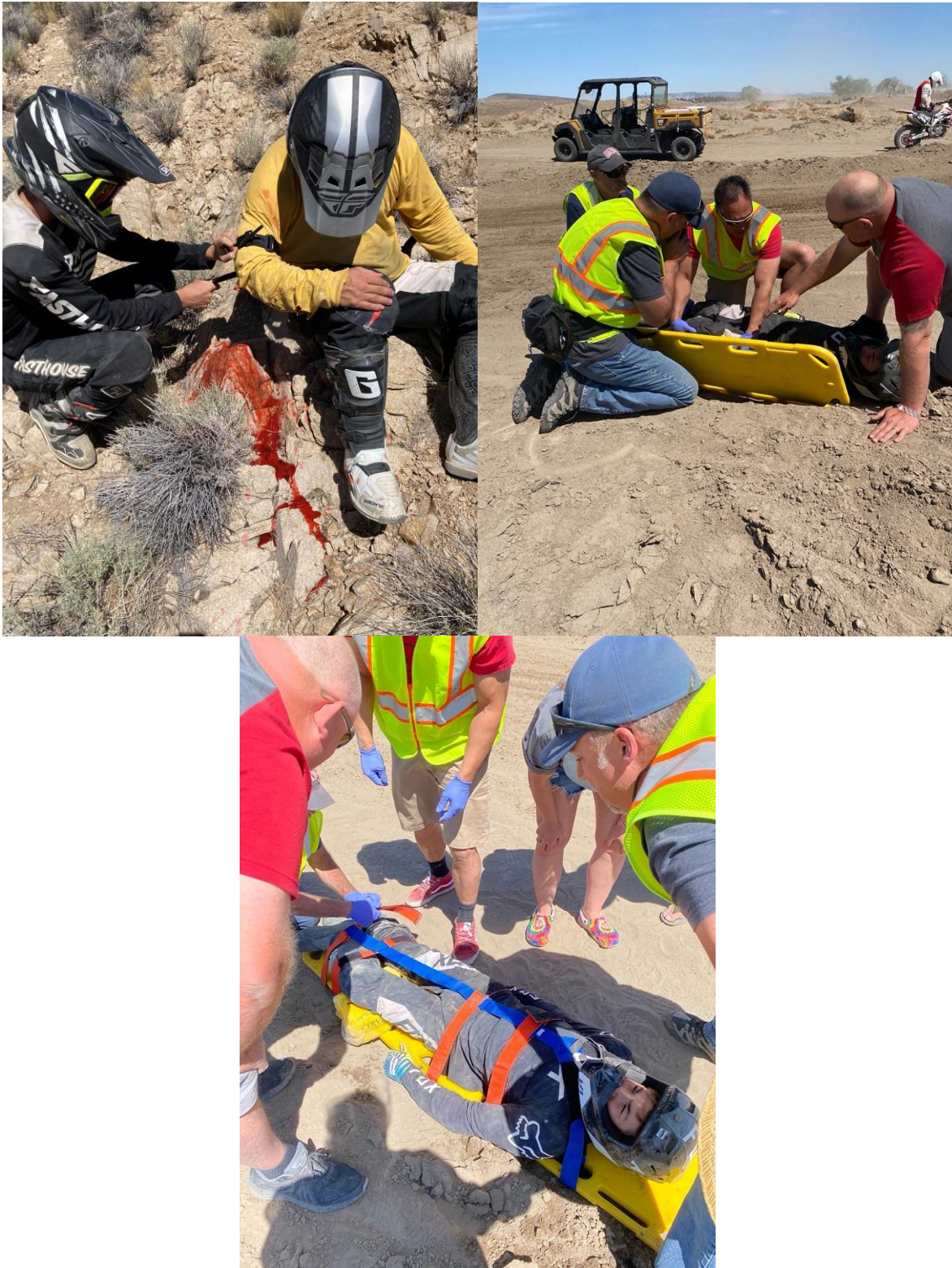
SSRM Course Medics & Equipment