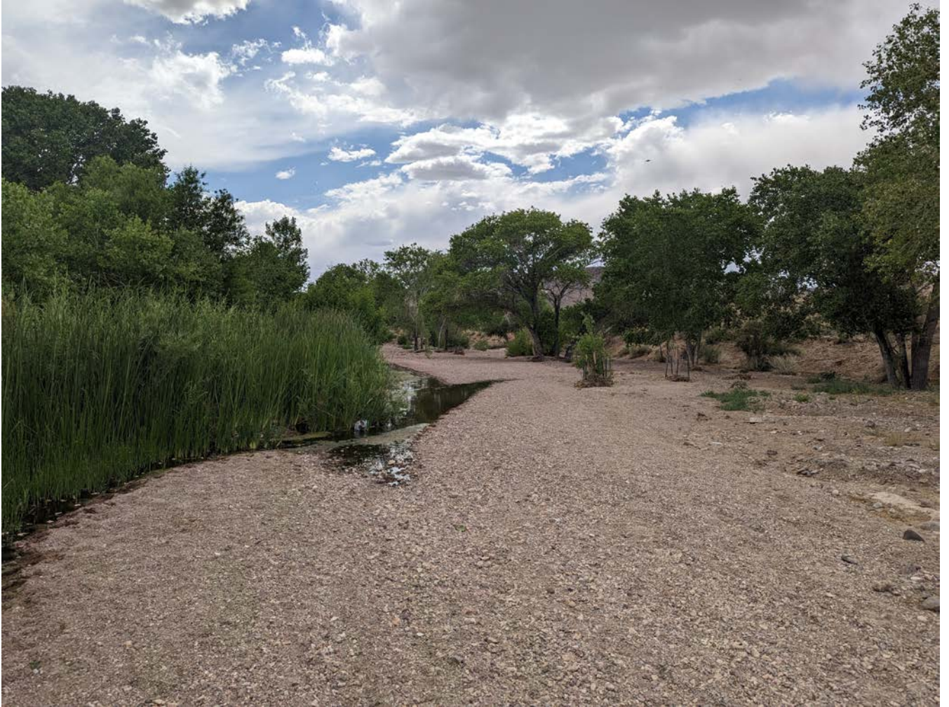
West side of proposed Amargosa River crossing.