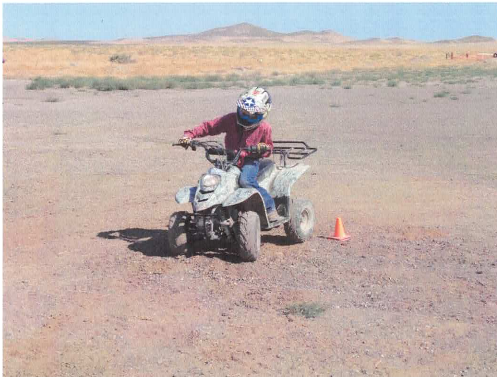
Learning how to properly shift their weight in a turn