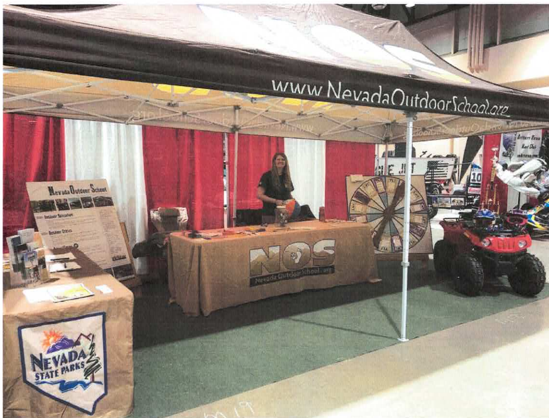
Nevada Outdoor School Road Show at Reno Motor Sports