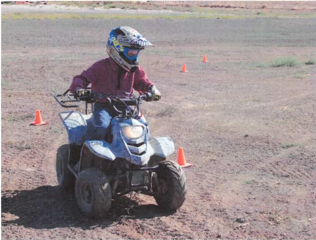
Youth ATV Safety Training