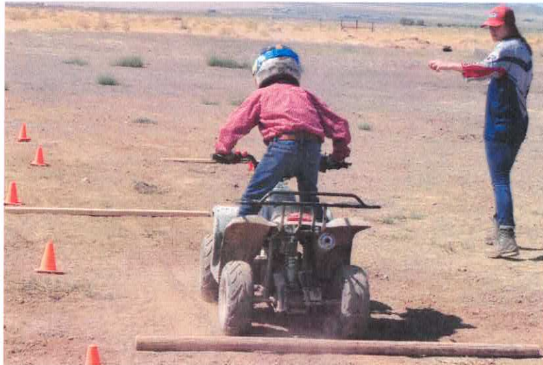
Youth ATV Safety Rider Course