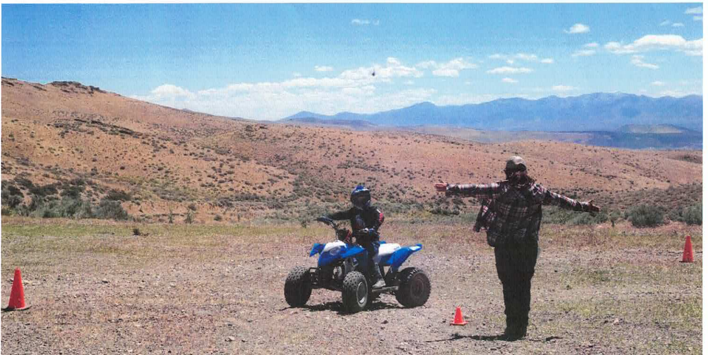
Youth Rider on the ASI regulated ATV Safety Course being directed by Outdoor Ethics Program Director