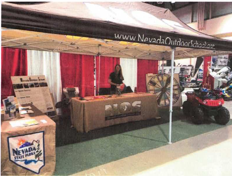
NOS Outdoor Ethics "Road Show" at Reno Motor Sports