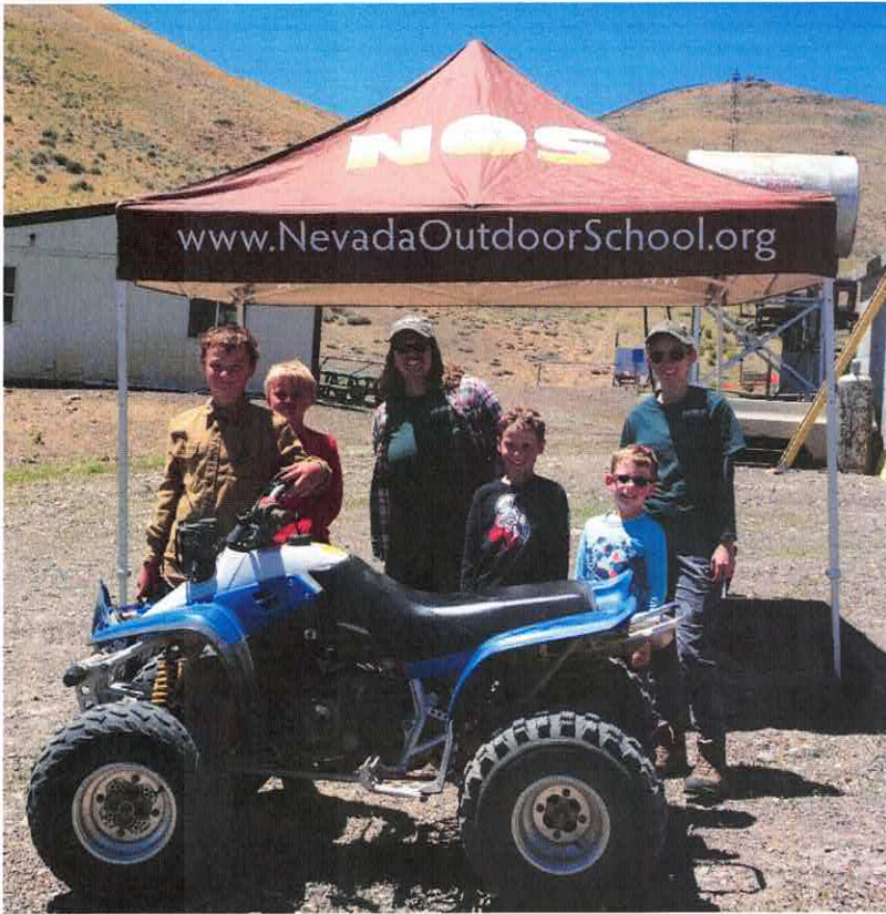
Elko ATV Camp 2020 at Elko Snow Bowl