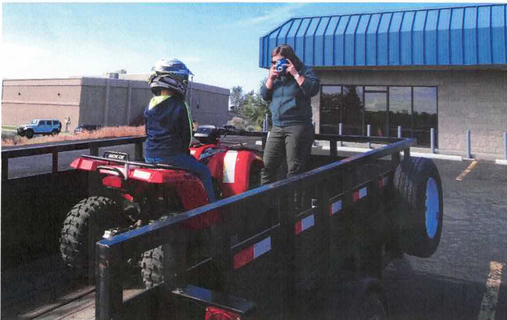
Taking a Polaroid photo of Youth decked out in appropriate safety gear at ATV Camp