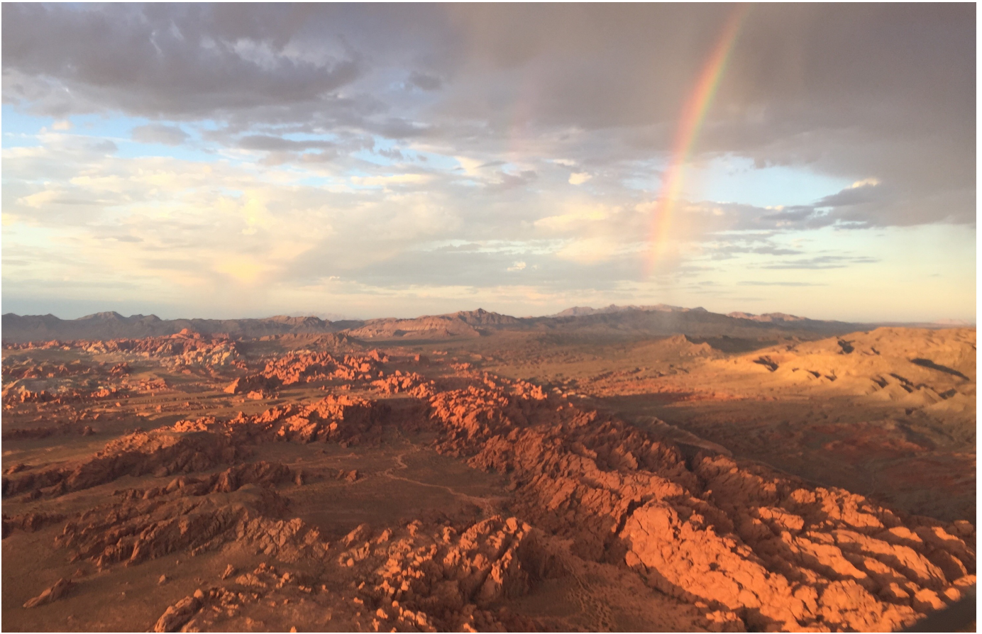
Arial views of Logandale Trails.