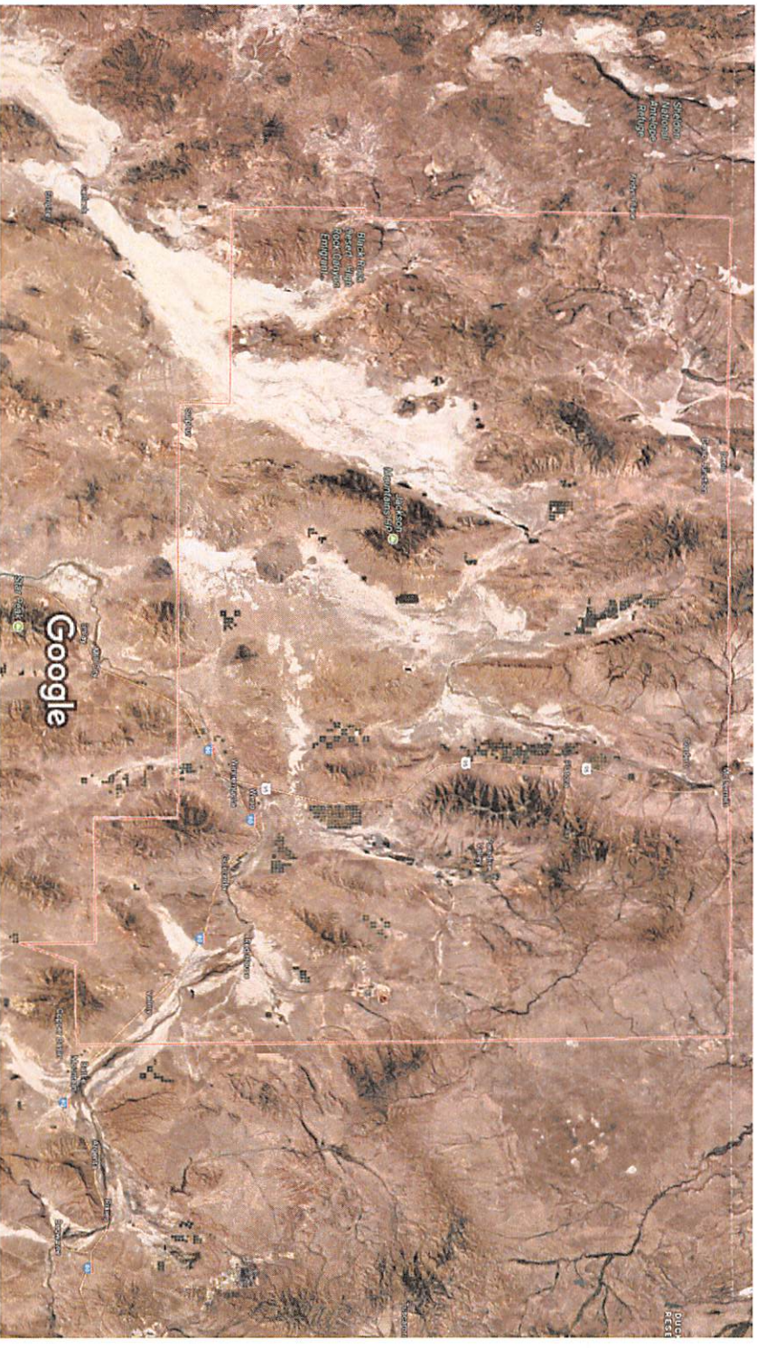
Imagery ©2017 Landsat / Copernicus, Map data ©2017 Google United States 10 mi