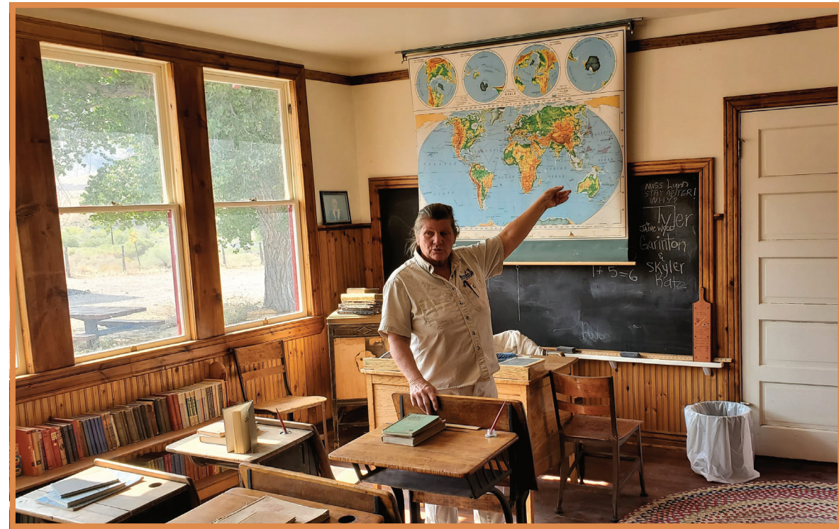
Inside Elgin Schoolhouse — Call Kershaw Ryan State Park for a tour