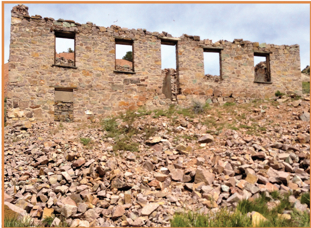
Delamar Mine Ruins