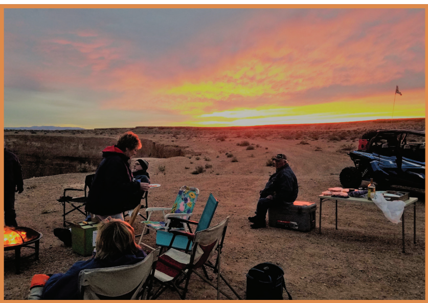
Picnic on Flat Top Mesa