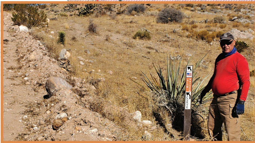
Slow Down and Stay to the Right on Hills and Curves

Currently, registration of an off-highway vehicle is not required if the off-highway vehicle: "Is registered or certified in another state and is located in Nevada for not more than 15 days." Please check with any city or locality as to their restrictions for OHV use.