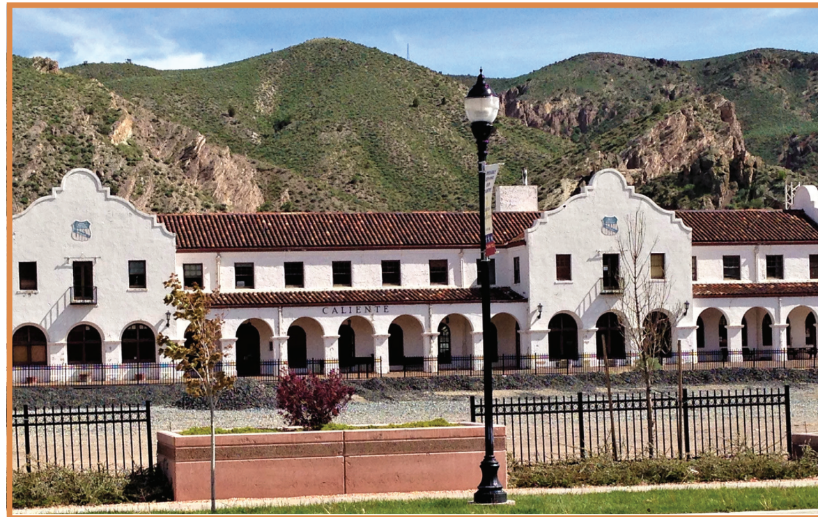
Old Caliente Depot