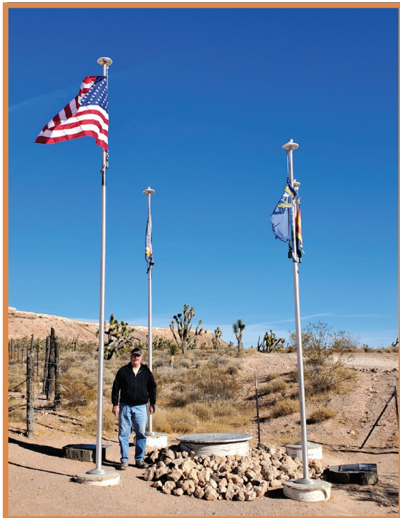
Three Corners Monument