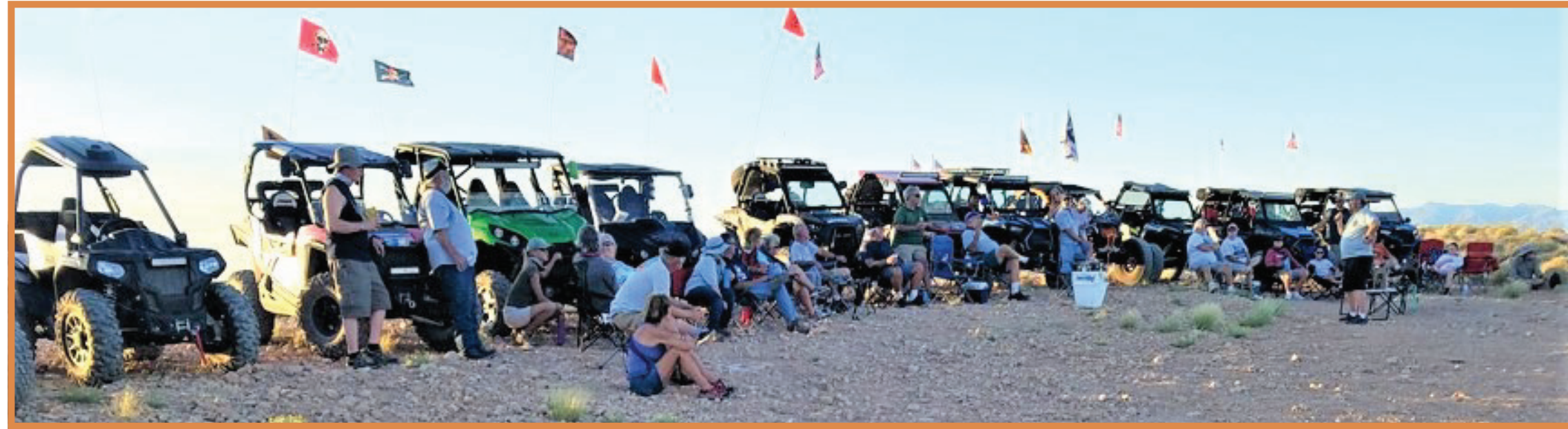
Kokopelli ATV Club Meeting on Flat Top Mesa