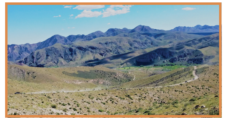
Pennsylvania Canyon Road

Most significant intersections on major OHV roads and trails are signed between Mesquite and Caliente, Nevada. Many minor roads and trails branching off of the major roads are not named or signed. Just because roads/trails appear on this map, they may not be in good shape or safe to travel for your vehicle and driving experience level. Use your own judgment before using trails. Road conditions can change during and after significant rain/snow events. Watch the weather.