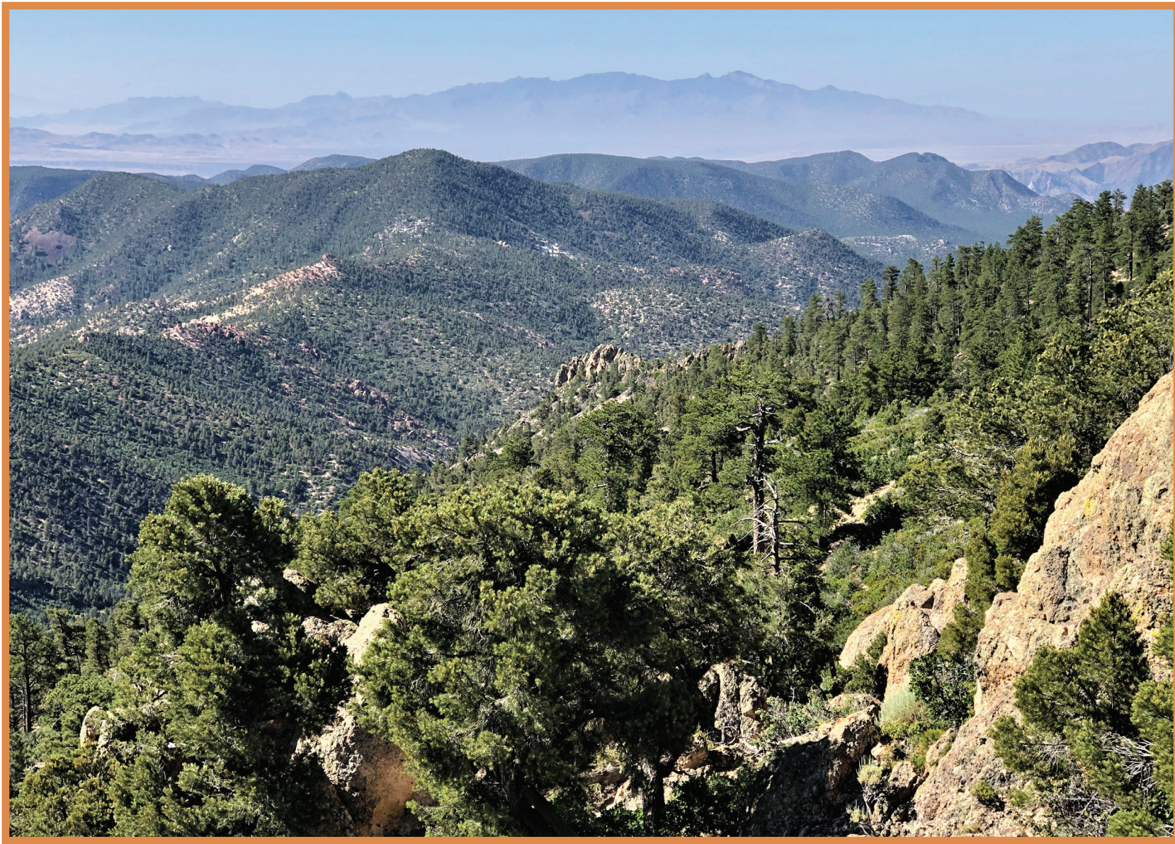
Ella Mountain BLM Tower View

Adapted from: https://www.treadlightly.org/learn/ Visit Website for more information.