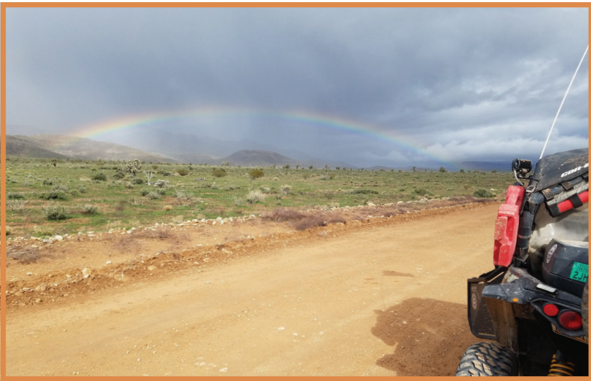
Rainbow Pass Road, really!

(NOTE: this is not intended to be a complete comprehensive list)