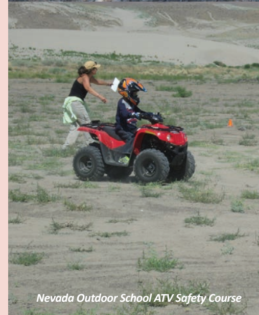
Nevada Outdoor School ATV Safety Course