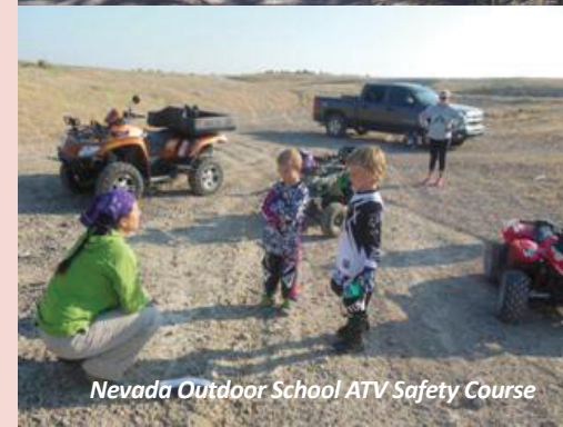
Nevada Outdoor School ATV Safety Course